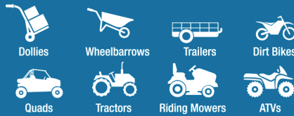
Dollies Wheelbarrows Trailers Dirt Bikes Quads Tractors Riding Mowers ATVs